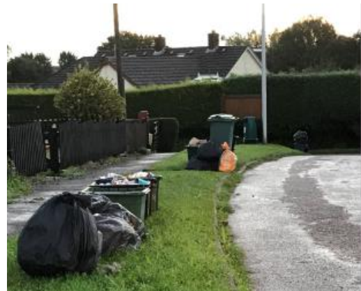
Holcombe Rogus Where