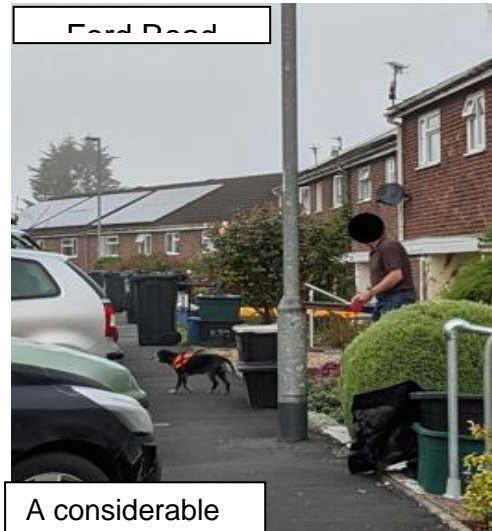
A considerable improvement