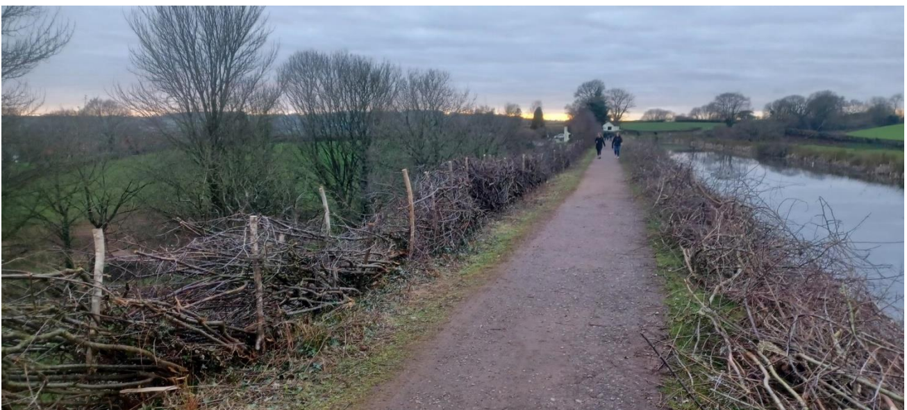
The section of hedge near Swing Bridge after two Volunteer Days in December and January