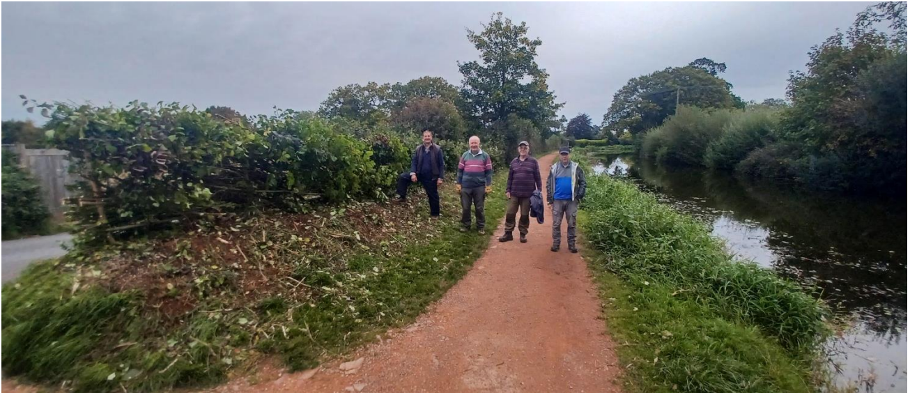
The section of hedge near Tidcombe Bridge laid by volunteers in October

Volunteer Days have been held on the second Sundays of each month and the task for each one has been hedgelaying. A small group laid a section of hedge near Tidcombe Bridge in October and in November the volunteers continued work at the hedge behind the boat moorings at East Manley Bridge. In December and January work started on laying the hedge on Swing embankment, with several new volunteers joining in and a record length of hedgelaying achieved during the January event. Work continued here during the February event and with 120m completed here that section is finished for now, with the remainder needing to grow on for a year or two until it is ready to lay.